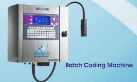
Batch Coding Machine