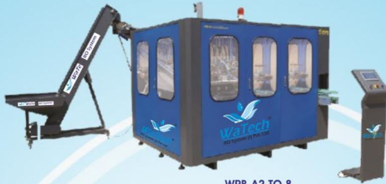
WRB-A2 TO 8