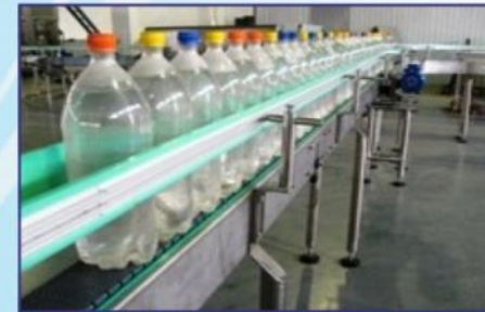
Air & Slate Conveyor