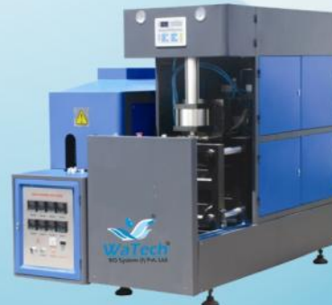
WRB-S5 TO 10 (5 TO 10 LTR JAR - 300 TO 500 PCS P/H WRBS-5-10)