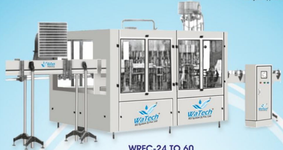
WRFC-24 TO 60