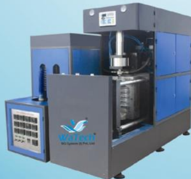
WRB-S20 (20 LTR ( 5 GALLON) 60 TO 90 PCS P/H WRBS-20)